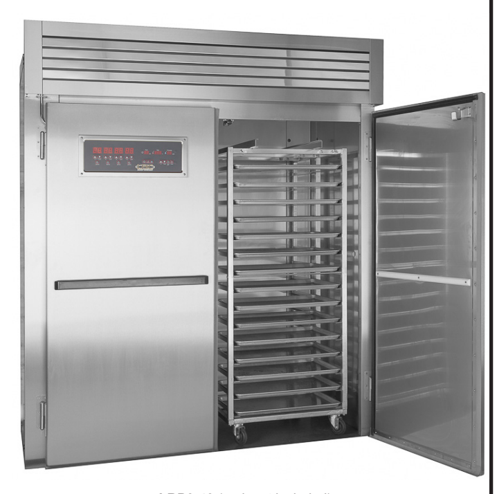
LRP3-40 (rack not included)